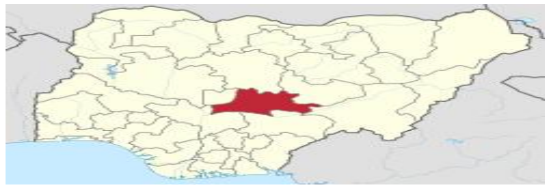
Figure 1. Location of Nasarawa state in Nigeria