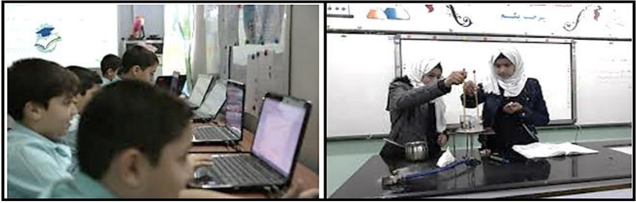
Figure 4. Development of Education Systems in Schools

In Iraq, the education system is run via the Ministry of Education with Higher Education. According to the reports of (UNESCO), Iraq was in the history before the first Bight War, in 1991 had an educational system that was one of the best educational systems in the region and has won two prizes from the organization and Iraq become a country free of illiteracy, after a wide campaign to eradicate illiteracy which was begun in the seventies of the last century, where the proportion of primary school enrollment was via nearly 100%, besides to a high proportion of those who were able to read and write, while the governments that came after the occupation have neglected the education intentionally to serve the interests of Regional and global forces where they view of Iraq's progress as a threat to the chances of hegemony.