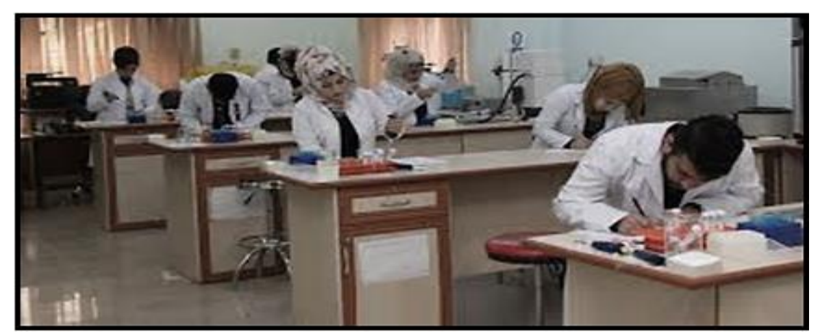
Figure 6. Development of Education Service