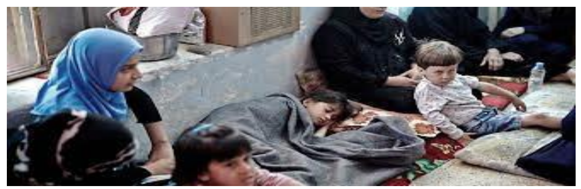
Figure I. Problem of Population and Housing

Physical debility, national disaster, religion, culture, civil ,,at the contemporaneous time, has been encrustation two greatest vital complications like: the first one is to come across the swelling demand aimed at food with other requests merchandises (Demewozu, 2005), plus to the second is exhausting the prevalent poverty via the ever increasing population. And there is no Population and Housing.