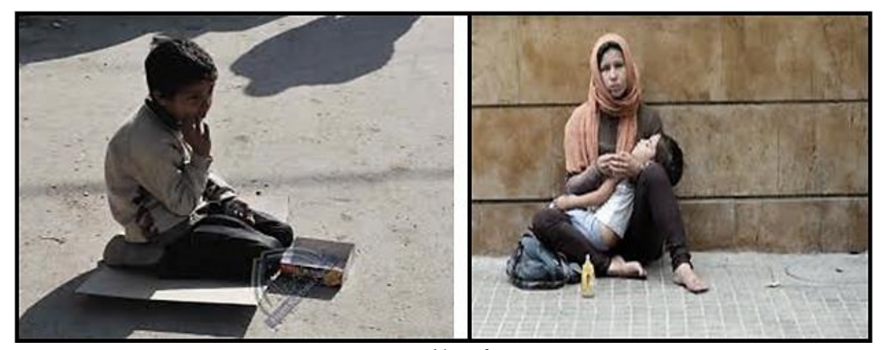
Figure 2. Problem of Services

Government of Iraq should offer and provide numerous services like free education, scholarship for children (Powers, Martin. 2019), mealtime, house place, helping card, source of water, electricity, etc.