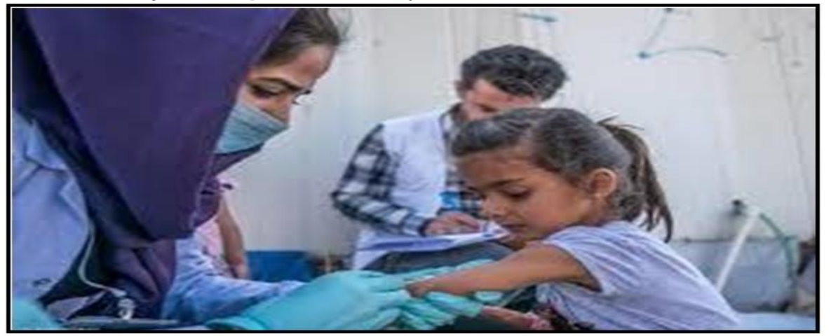
Figure 5. Development of Health Service for Children Health