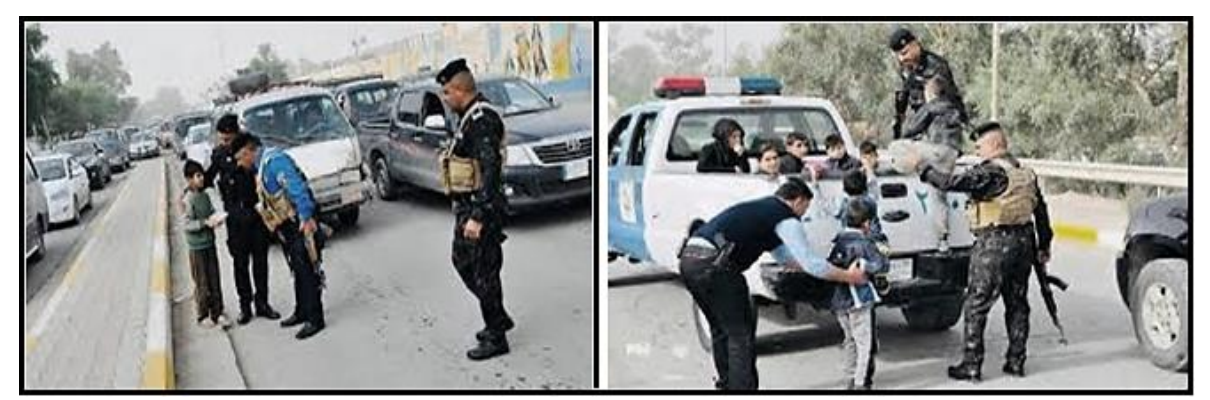
Figure 3. Decreasing of The Begging of Children in Iraq