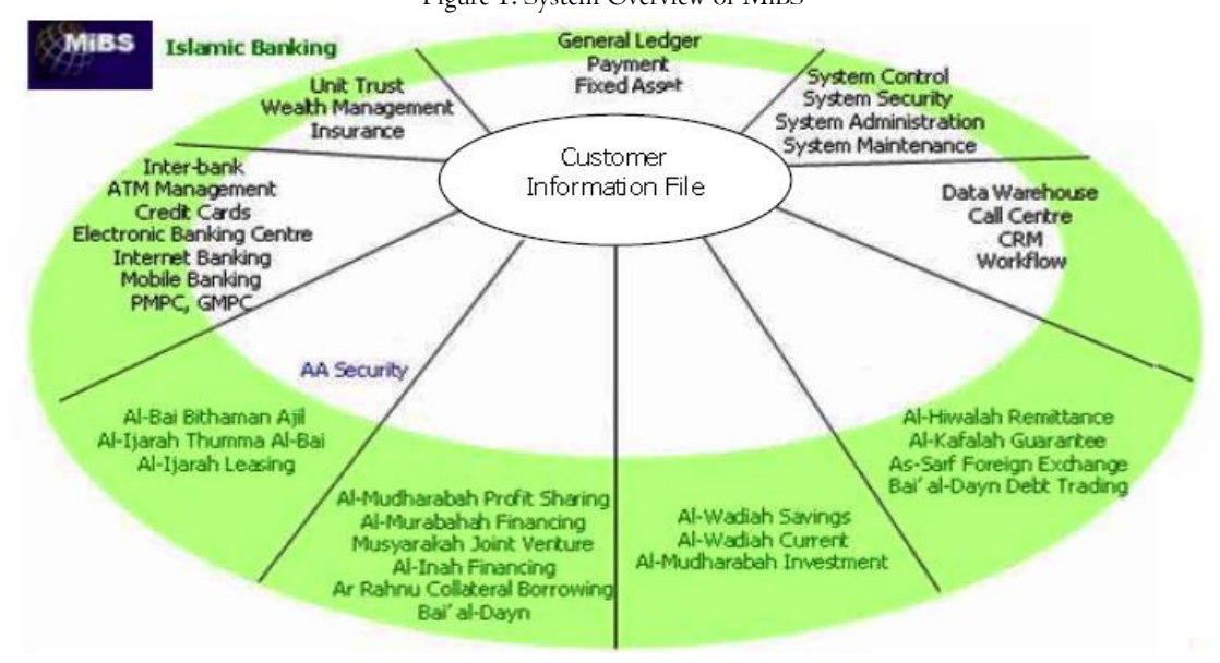
Figure 1: System Overview of MiBS

MIBS provides a complete plan to meet the needs of global financial transactions. The system is based on conventional banking practices with the application of new technologies of information and communication and distribution channels as the internet. Reflexability, parametricity, and security of MIBS are of its characteristics. MIBS was designed and developed on a 3-tier architecture of client/server and Online Transaction Processing (OLTP). This architecture provides a smoothed distribution and concentrated online transactions with the load-balancing capability and fast responding and low bandwidth requirement. MIBS is compatible with the Linux operating system and IBM-z series mainframe systems. MIBS covers Islamic banking products with multi-currency and multi-financial-institutions capabilities.