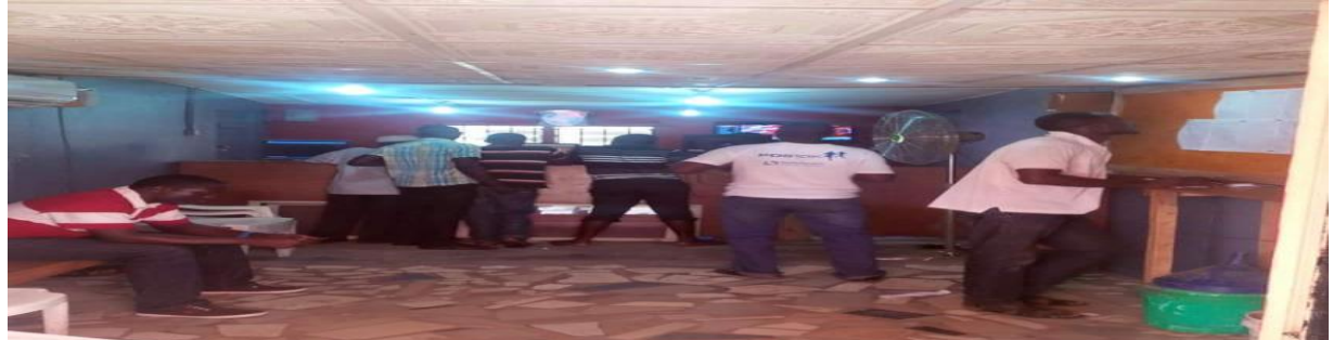
Sport Betting Shop in Nigeria

According to MRPEPE.COM (n.d.), the start up cost is estimated at \(\frac{N}{2}\)56,000. This is a worst-case scenario budget. In terms of remuneration, the owner of the Café is entitled to 50% of profit (profit means total stakes minus total wins); however in a situation where the total wins are more than total stakes, the betting platform will send money to the agent to pay off the debt (Castles, 2015).