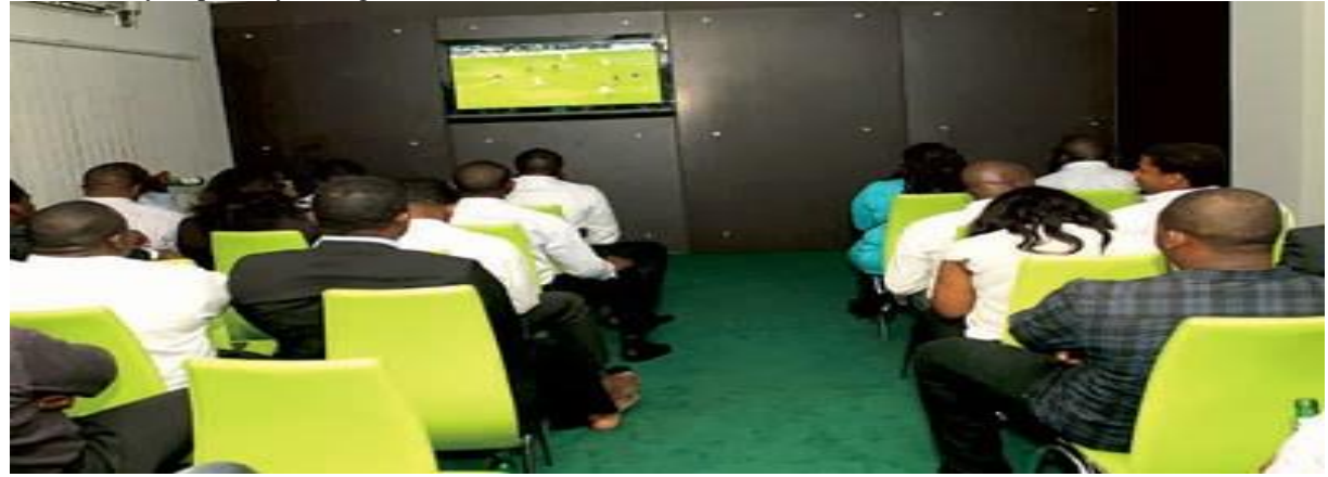
Figure 5: A Football viewing center in Nigeria

The person dabbling into the business is expected to have interest in sports. No need of going for any training before setting up the business. The person starting the job may require the services of a sales person, who will be collecting money and issuing out tickets. According to Babatope (2017) the start up cost is N200,000, N500,000 to N700,000 depending on the scale of the football viewing center business to be operated. The estimated earning is N70,000 above monthly, especially during football season.